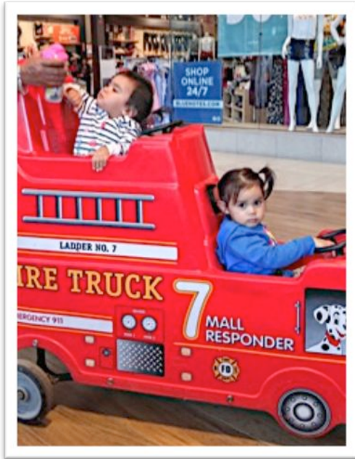
Cute shopping carts available for families at St. Vital Mall.

Bus Trips and Watermelon & Roll Kuchen Parties